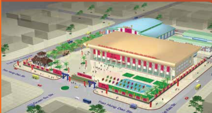
Standing organizing board

Venue: Friendship Cultural Palace, 91 Tran Hung Dao, Hanoi, Vietnam